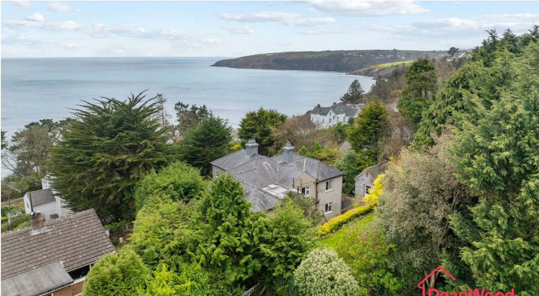
The Evergreens South Cape, Laxey, Isle Of Man, IM4 7JB Asking Price £565,000